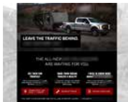
Landing page based on region