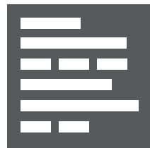
Lead gen form based on button clicked