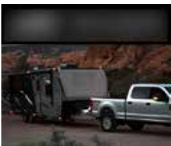
Display ad based on region

From the PPC campaign, Force 5 drove each user to a unique landing page that was region specific. The landing page had imagery similar to what their “local backyard” would look like and listed the name of the dealer nearest to them. Three action buttons were present on each landing page. By making user choices limited and simple, Force 5 decreased the chance of a user leaving without taking action (bounce rate). Each button directed the user to a form. Once that form was completed, a custom message based on user’s location was displayed indicating which local dealer would be contacting them within 24 hours.